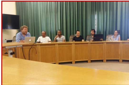
SWISS ROOIBOS PROJECT